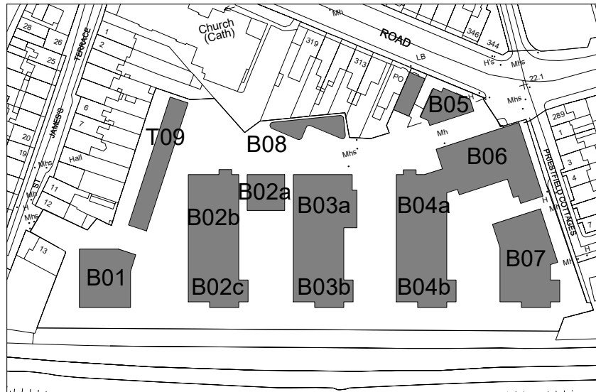
SITE KEY PLAN

AREAS OF WORKS TO BE TAKEN IN CHARGE BY LOCAL AUTHORITY SUBJECT TO AGREEMENT